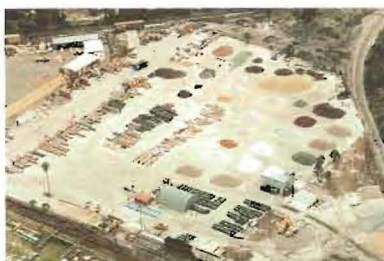
PEBBLE JUNCTION Sanford, Florida