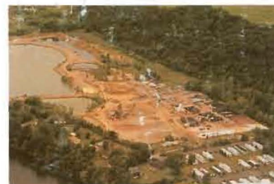
DELAWARE VALLEY LANDSCAPE STONE Wholesale Division Upper Black Eddy, Pennsylvania