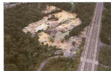
LANGHORNE STONE COMPANY Langhorne, Pennsylvania