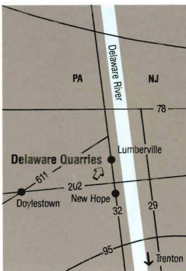
DELAWARE QUARRIES Route 32 Lumberville, Pennsylvania 18933 Phone: 215 297-5647 FAX: 215 297-5178