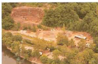
DELAWARE QUARRIES Lumberville, Pennsylvania